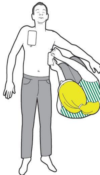
Adults - AED positions